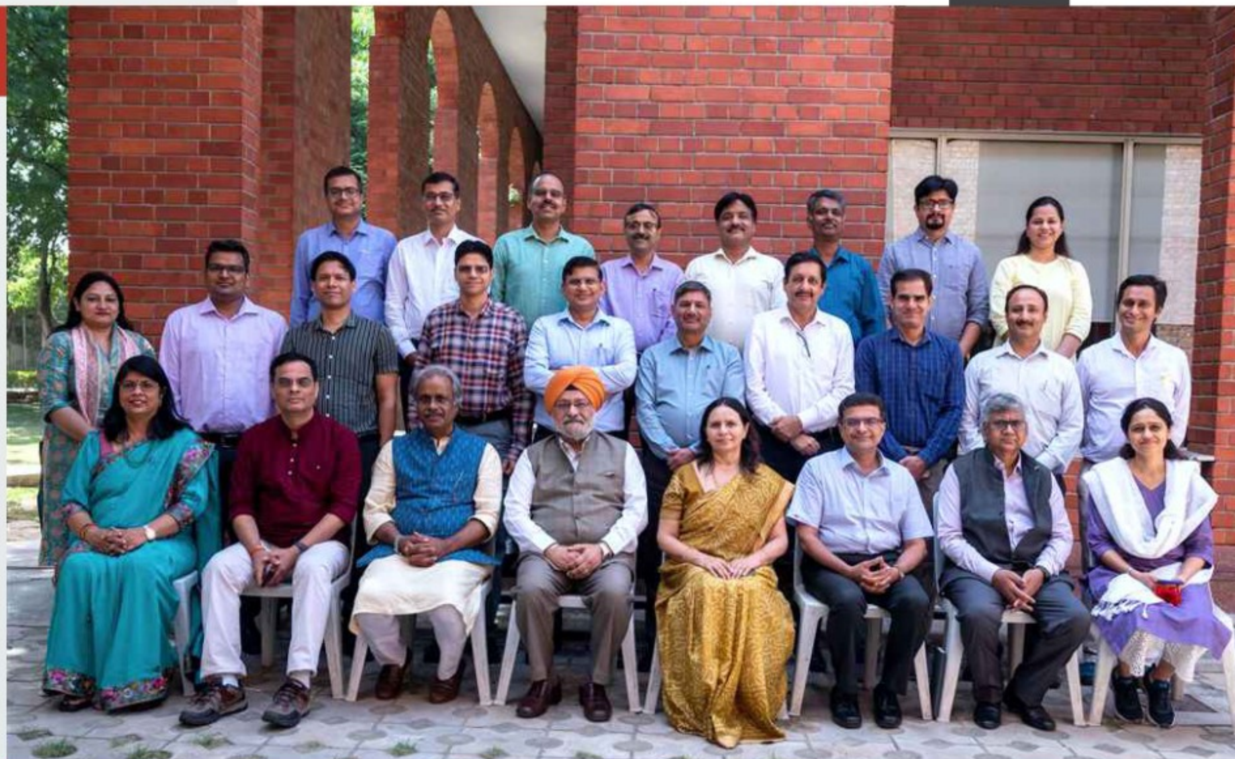
15 th & 16 th Class of 2022-24 & 2023-25