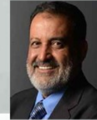
Shri. T V Mohandas Pai