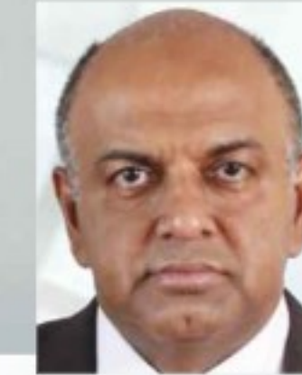
Shri. Sanjeev Bikhchandani